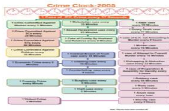
Table 2 Details of Crime Against Women In The Year 2005